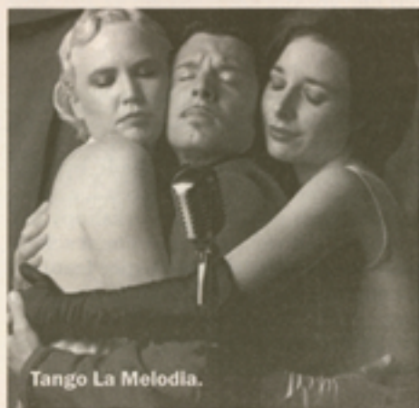
Tango La Melodia.

Tango La Melodia is a Gypsy jazz band and a sharp-dressed shard of a theater company. Its new production, written and designed especially for Valentine's weekend and the tiny juke joint it calls